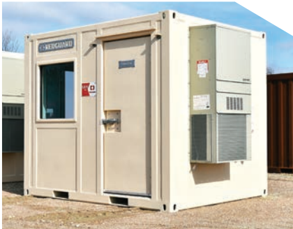
CoverSix guard shacks and security offices provide amenities to include windows, HVAC, work surfaces, data outlets. They can be engineered to provide protection from explosives and ballistics.

CoverSix designs and manufactures custom security facilities. Our buildings not only provide protection for security personnel and guards by being hardened against blasts, ballistics, and forced entry, they provide a functional space to perform security operations. CoverSix can design scalable facilities for a variety of uses, like guard shacks, access control points, overwatch towers, visitor centers, entry control points, or security offices. We can meet your facility's requirements for functionality and physical deterrence.