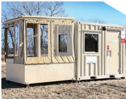
The Fixed Fighting Position (FFP) is ballistic resistant, weather-protected, and designed to house two machine gunnery personnel with 1 floor-mounted machine gun