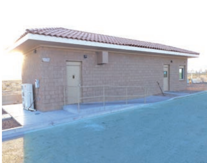
CoverSix can design and construct modular security facilities with a variety of facades and finishes to match existing architecture or create first in class aesthetics.