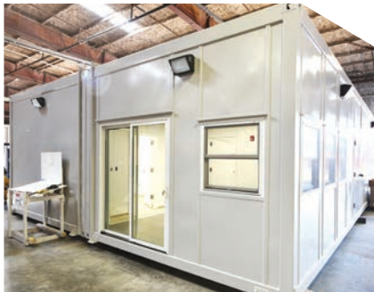
Access Control Points are not limited in size or scope. Multi-section facilities can be over 10,000 sqft and include kitchens, restrooms, and locker rooms in addition to the security office environment.