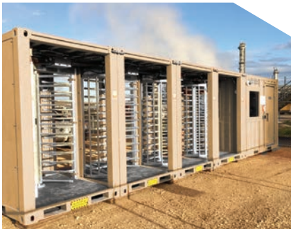
CoverSix's security capabilities include turnstile modules which are single turnstiles mounted inside of an all-steel frame to provide scalable access control and prevent piggybacking.